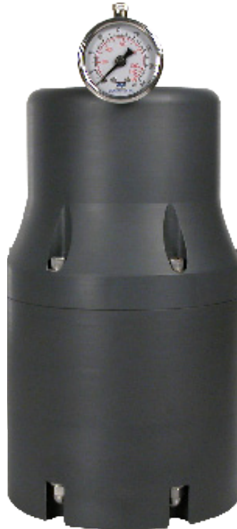
85 cu in