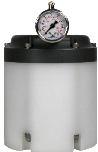
40 cu in