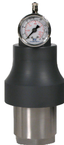
12 cu in