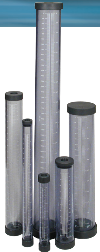
Sigmamotor Calibration Cylinders are available in eight sizes.

Cap is sealed with an O-ring and includes an NPT vent connection. Used in applications where frequent cleaning is required, such as polymer, alum, ferric chloride or chlorine.